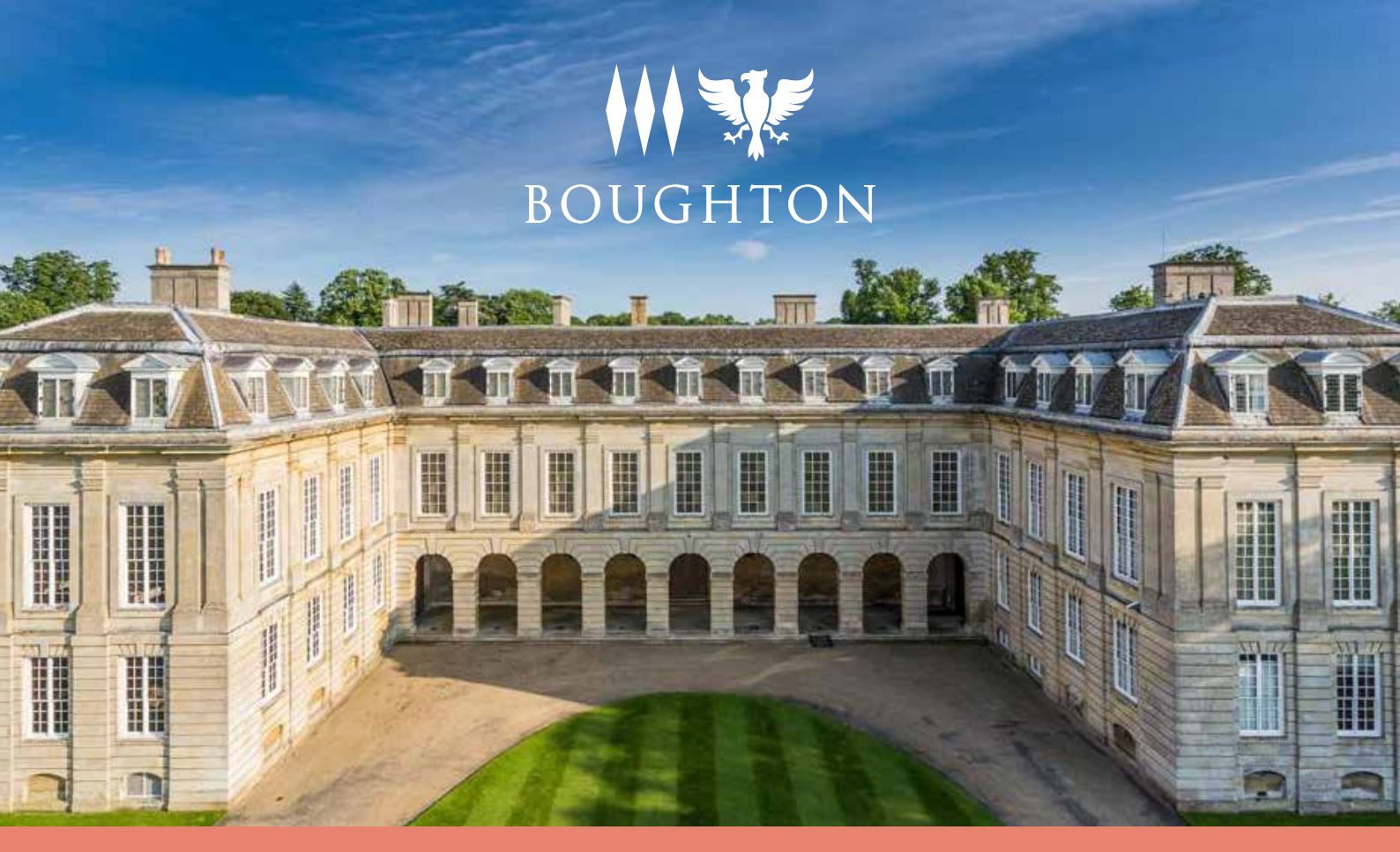
Let our family history become part of your family's future