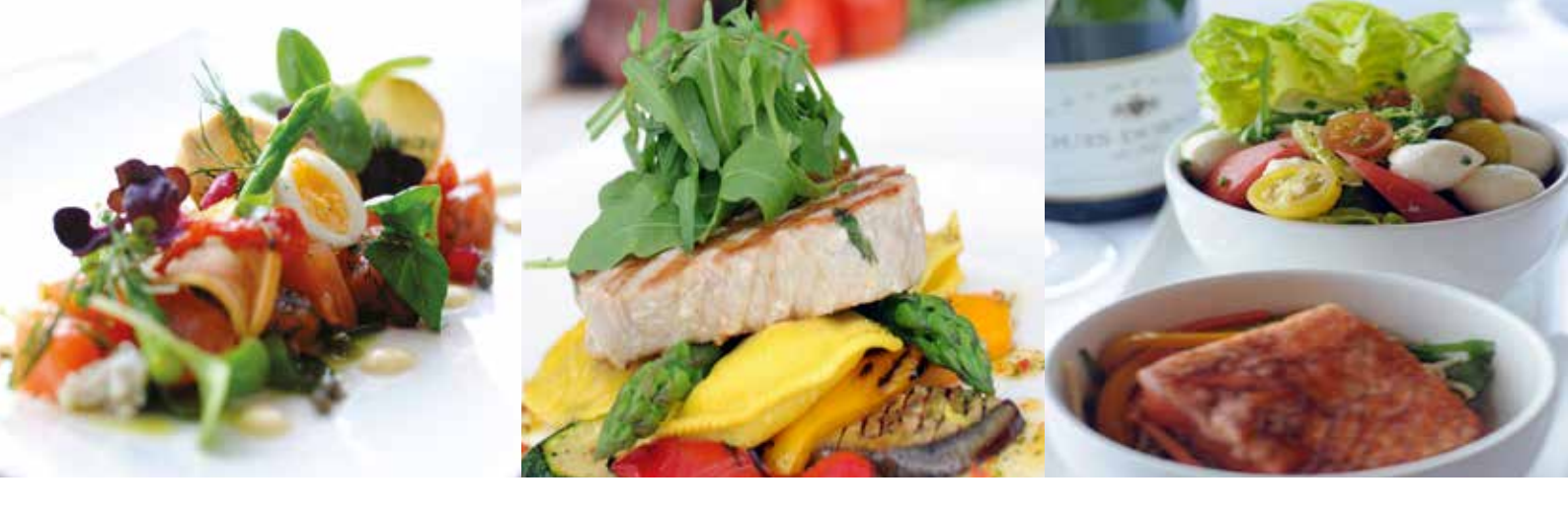
Expert food and hosting by