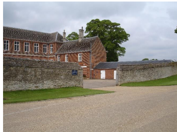
Stable Yard entrance