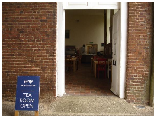
Tea Room entrance