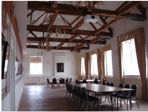
Tapestry Suite interior