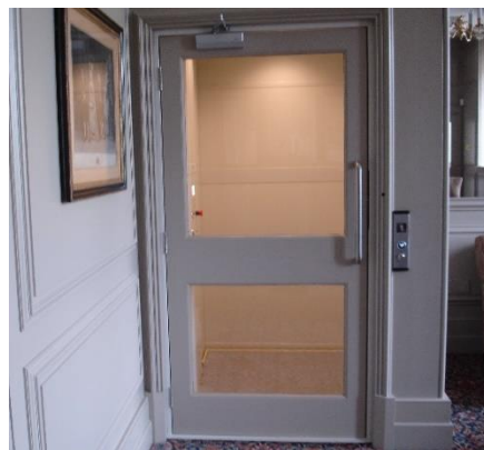
Tapestry Suite lift