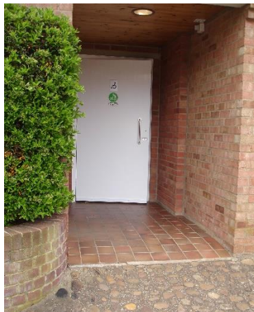
Accessible WC entrance