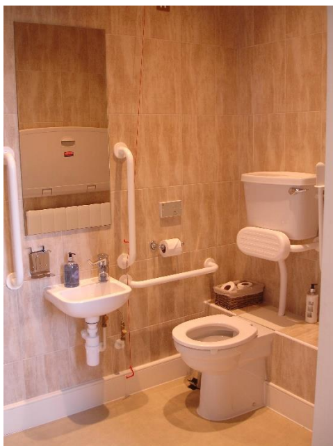
Accessible WC in Tapestry Suite