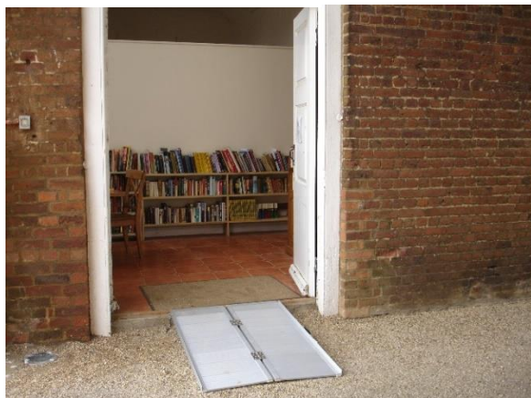
Book Shop entrance