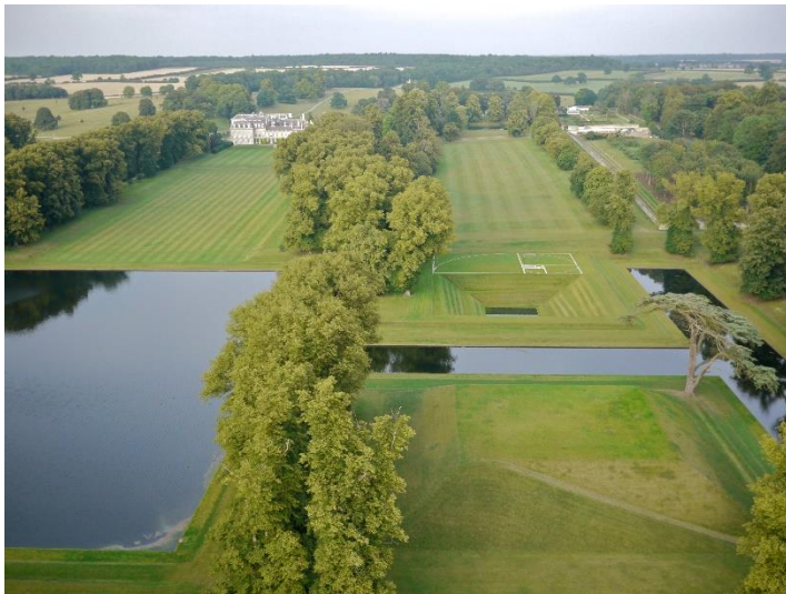
Ariel view of grounds