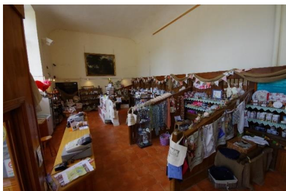
Gift Shop interior