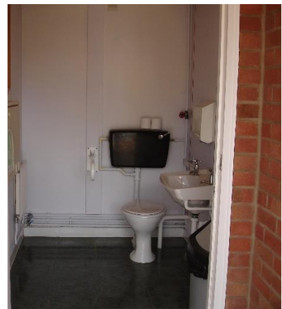
Interior of accessible WC