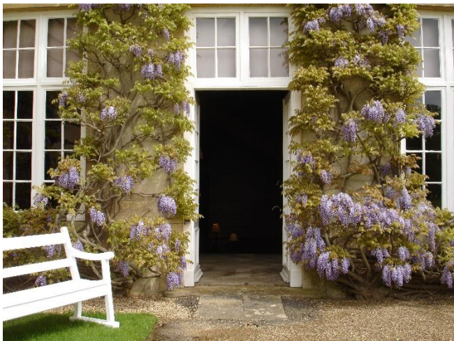
The accessible entrance to the property located on the West Front