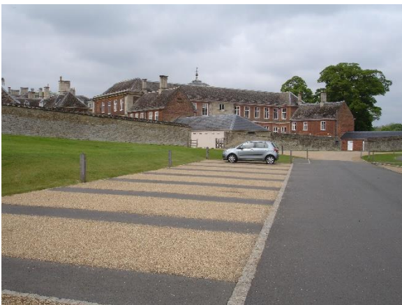
Blue Badge car parking bays