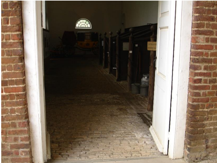
The Coach House entrance and cobbled flooring