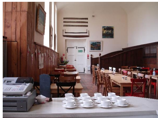
Tea Room interior