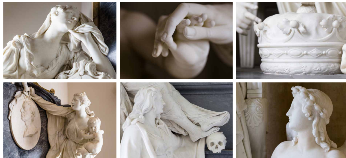
St Edmund's Church Warkton NN16 9XH

In 2014 – 2015 the Montagu Monuments Conservation Project undertook major works to all four of the principal monuments in St Edmund's Church, Warkton, to secure and protect them from damage caused, possibly, by over zealous cleaning in the past and by environmental issues, including pollution and high humidity levels. These monuments have now been secured and restored to their former glory.