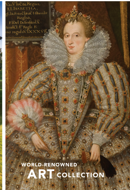
WORLD-RENOWNED ART COLLECTION